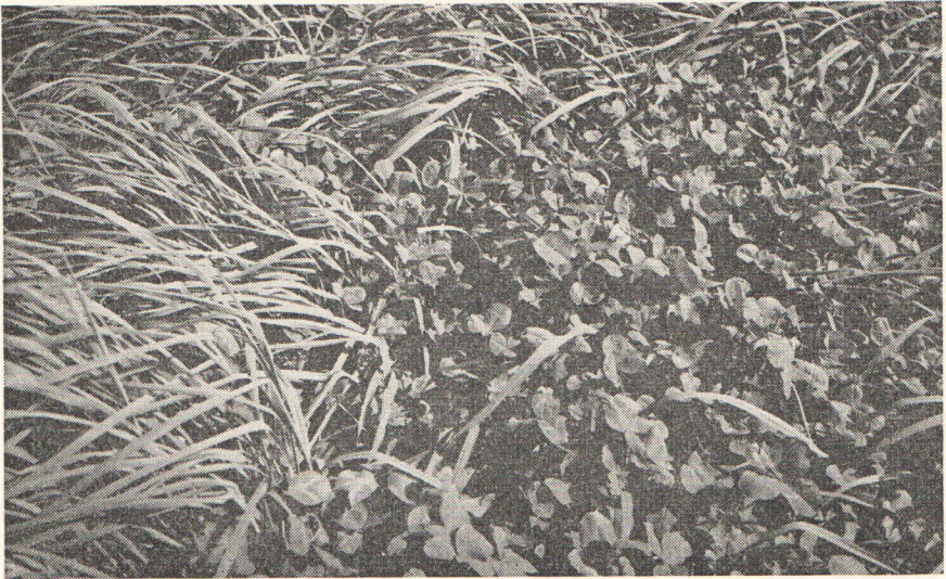
Fig. 1. Ladino clover and orchard grass are well adapted to the Piedmont and Mountain counties of North Carolina.