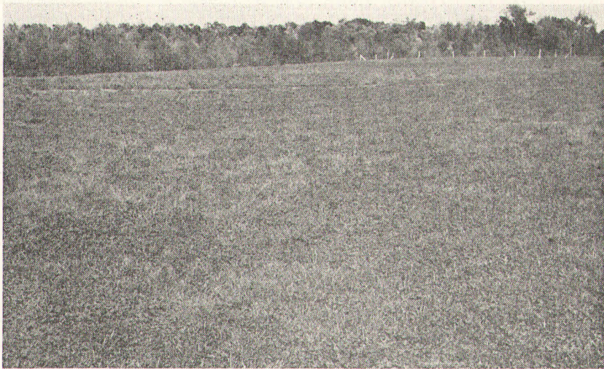
Fig. 2. Ladino clover and tall fescue on the Animal Husbandry Farm of the North Carolina State College. This area was grazed until December 22 in 1947.

in September 1947 had produced nearly one ton of forage per acre by April 15, 1948. Grazing can begin in March on established stands. E. W. Faires obtained approximately 200 cow-grazing days or the total digestible nutrients of 70 bushels of corn at the Coastal Plain Station, Willard, during 1947 from a Ladino clover-Dallis grass pasture as compared to only one half that yield from a similarly treated pasture in which the Ladino was omitted.